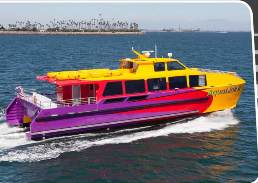
64' Catamaran "74 PAX"